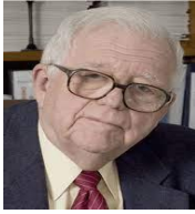
Eugene Braunwald, MD Boston, MA, USA